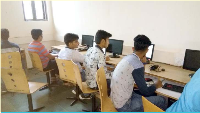
Students are designing 2D components

This course was structured in a pedagogical sequence, covering the Part, Assembly and Drafting. Every session is provided with detailed explanation of the commands and tools. This approach allows the students to understand and use the tool in an efficient manner. This workshop was