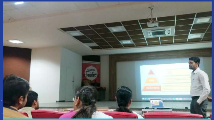
Faculties are discussing with presenter