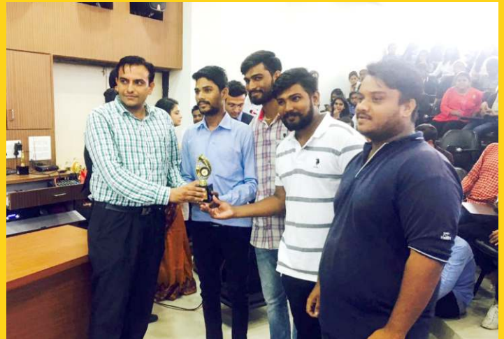
Six students of IMBA 3,5 and MBA had participated in Box cricket.

Two students from IMBA 3 had participated in Photography.