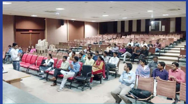
Faculty is presenting his ideas to the Audience