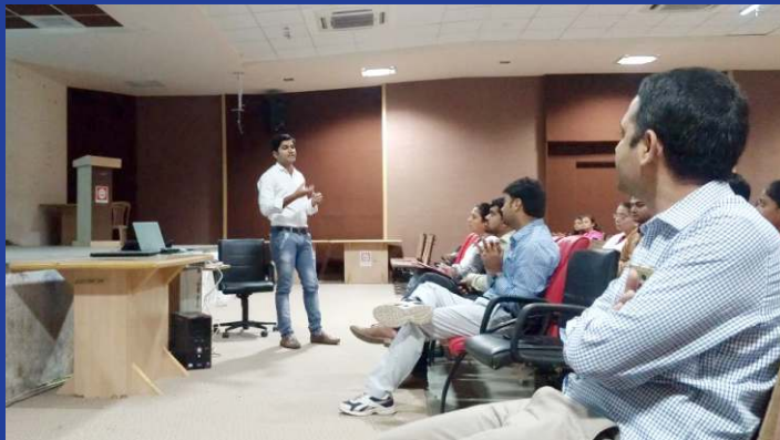
Faculty debates with review Panel