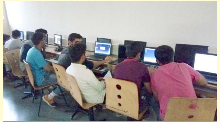
Students are doing assembly of the components

carried out from 3rd July, 2017 to 1st August, 2017.